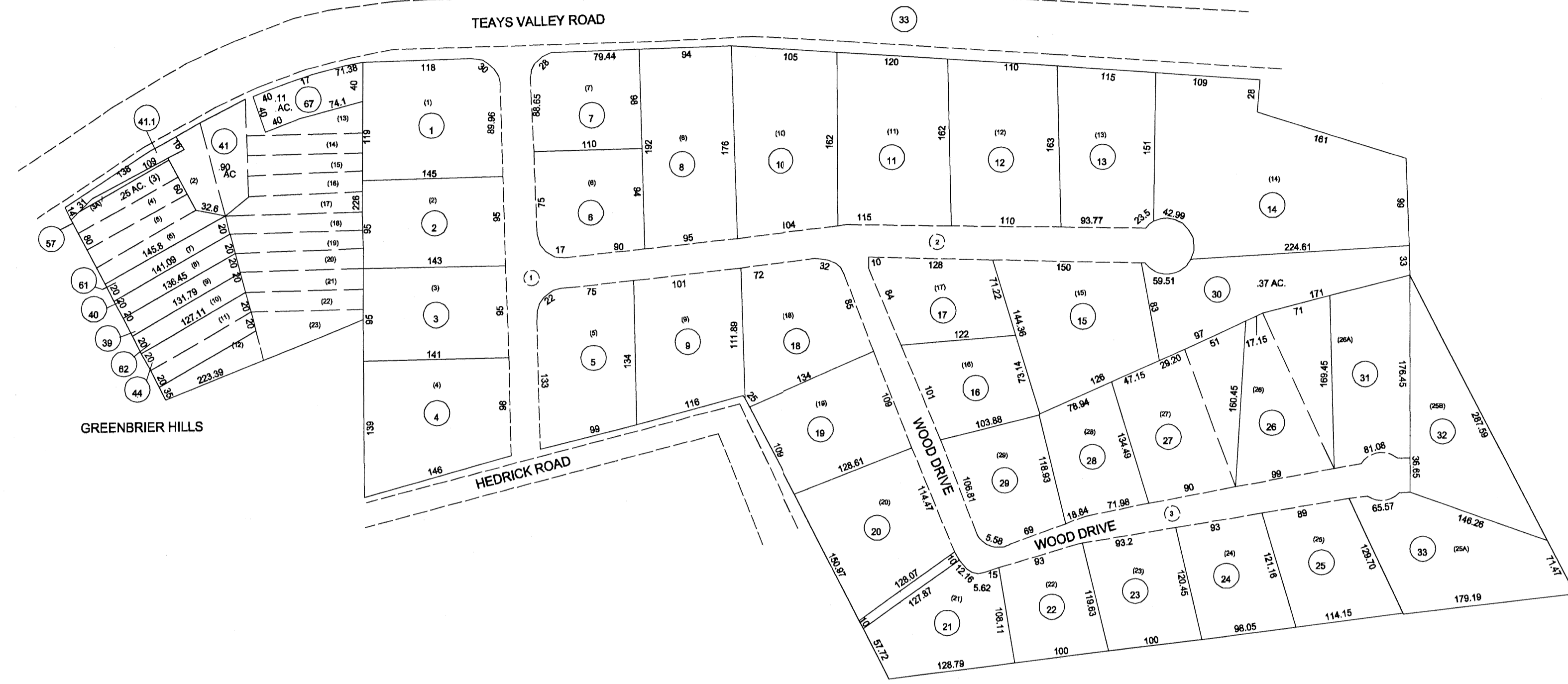
MEADOW WOOD ESTATES INSERT 1