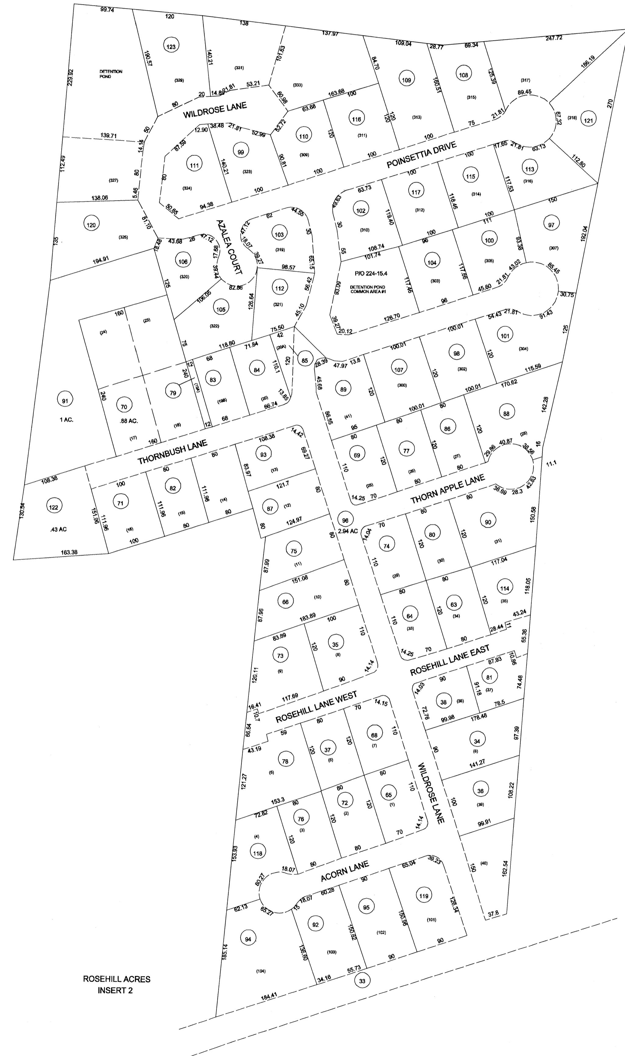
ROSEHILL ACRES INSERT 2