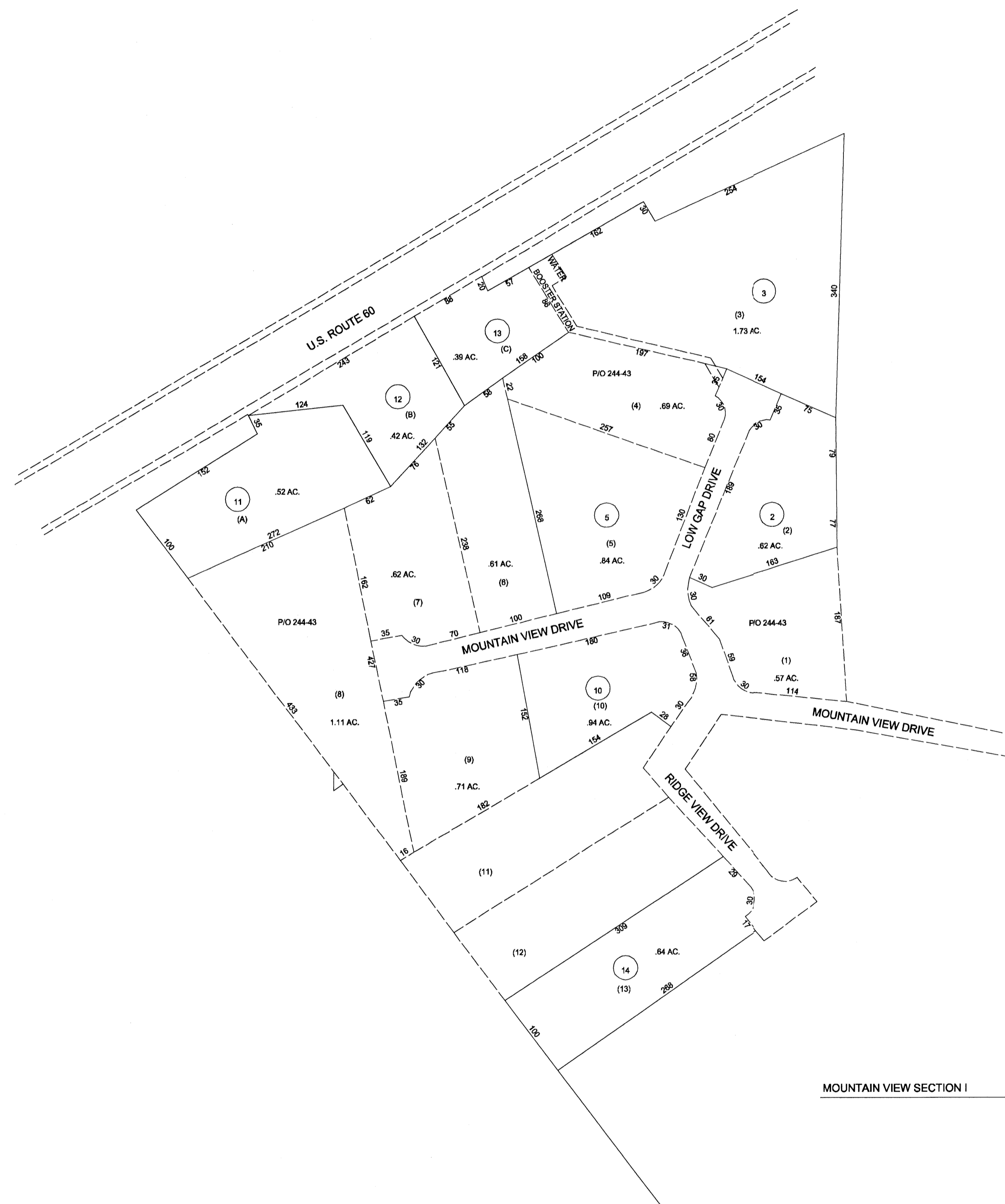
MOUNTAIN VIEW SECTION I